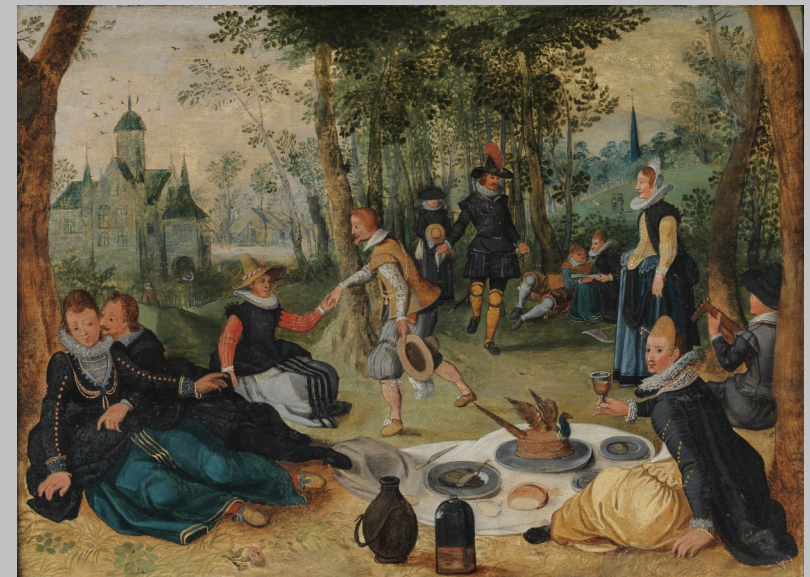
Sebastiaan Vrancx (manner of), A Picnic in a park, 1617-1620, oil on panel, 49 x 64 cm, Christian IV's Winter Room, east wall no. 10.

16:50 - 18:30 Visit to Rosenborg Castle The Winter Room and the van der Eichen tapestries followed by a reception at The Garden Café